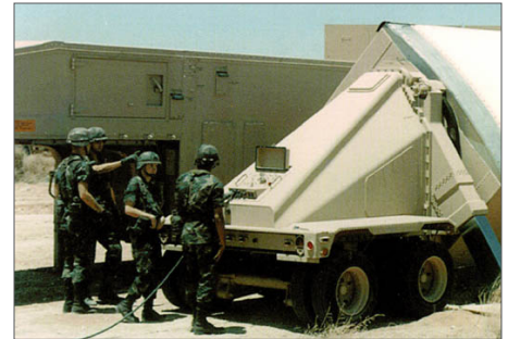
Weapon cooling systems are an important part of the overall design to ensure reliable performance regardless of the harsh operating environment.

It plays a vital role in the Ballistic Missile Defense System by acting as advanced "eyes" for the system, detecting ballistic missiles early in their flight and providing precise tracking information for use by the system. Use of multiple sensors provides overlapping sensor coverage, expands the BMDS battle space, and complicates an enemy's ability to penetrate the defense system, according to information approved for public release.