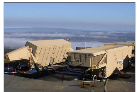
The antiradiation missile system has been deployed around the world and according to published reports, seven systems have been produced with three currently in production.