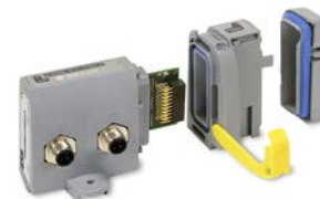
Moduflex IO-Link Module Diagnostic LEDs