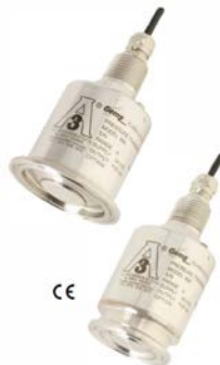
Gems 3A Sanitary Pressure Transducer