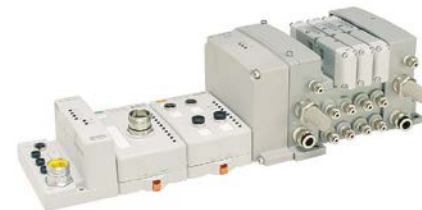
H Series ISO Valve