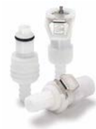
PPL, PPM Series