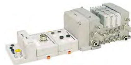
H Series ISO Valve