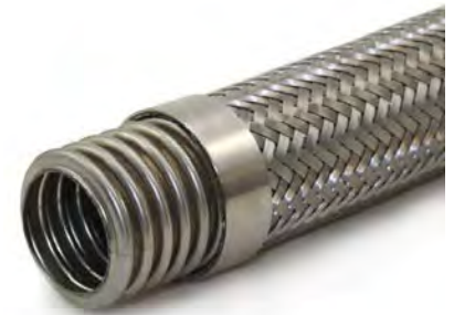
Hose Master chemical transfer hose

Ideal for aggressive chemicals and extreme temperatures, metal hose is also abrasion- and permeation-resistant