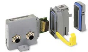
Moduflex IO-Link Module Diagnostic LEDs