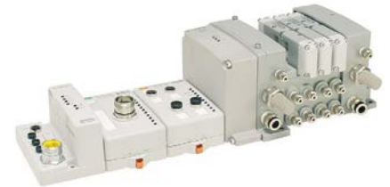
H Series ISO Valve