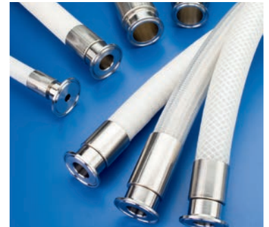
Page thermoplastic hose assembly