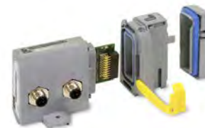
Moduflex IO-Link Module Diagnostic LEDs