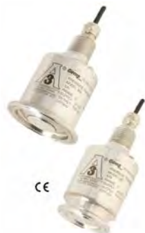
Gems 3A Sanitary Pressure Transducer