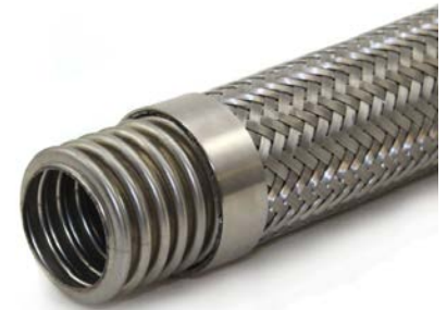
Hose Master chemical transfer hose

Ideal for aggressive chemicals and extreme temperatures, metal hose is also abrasion- and permeation-resistant