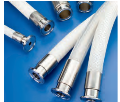
Page thermoplastic hose assembly