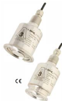
Gems 3A Sanitary Pressure Transducer