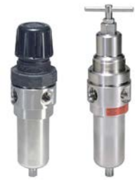
Parker's PB11/12 is a stainless steel particulate filter/regulator