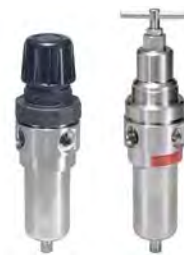
Parker's PB11/12 is a stainless steel particulate filter/regulator